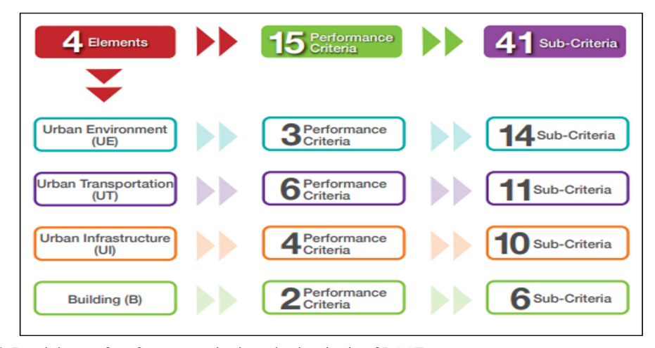
Figure 3. Breakdown of performance criteria and sub-criteria of LCCF